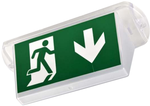
A-9100 Plastic double sided diffuser